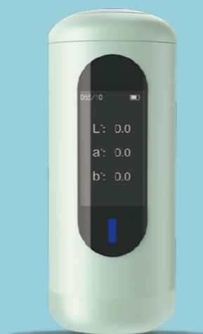
CR30 Enhanced Edition (With display screen)