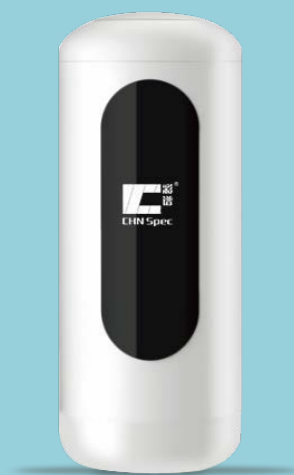
CR10 Professional Edition ( No display screen)